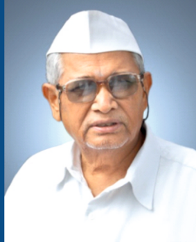
Padmabhushan Dr. Balasaheb Vikhe Patil