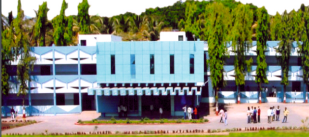
Padmashri Vikhe Patil College of Arts, Science & Commerce, Pravaranagar