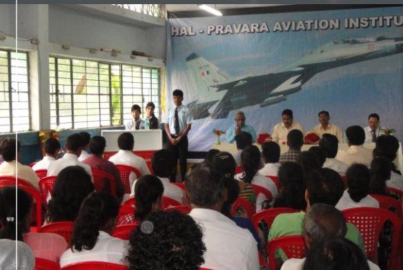
Induction function of new students