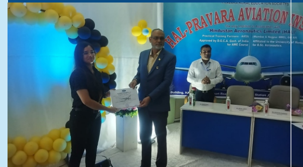
Student Felicitation by GM(AURDCHAL)