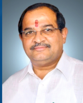
Shri Radhakrishna Vikhe Patil