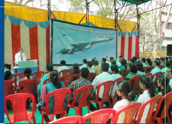
Parents - Teachers Meeting