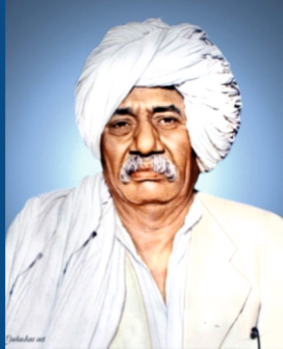
Padmashree Dr. Vithalrao Vikhe Patil